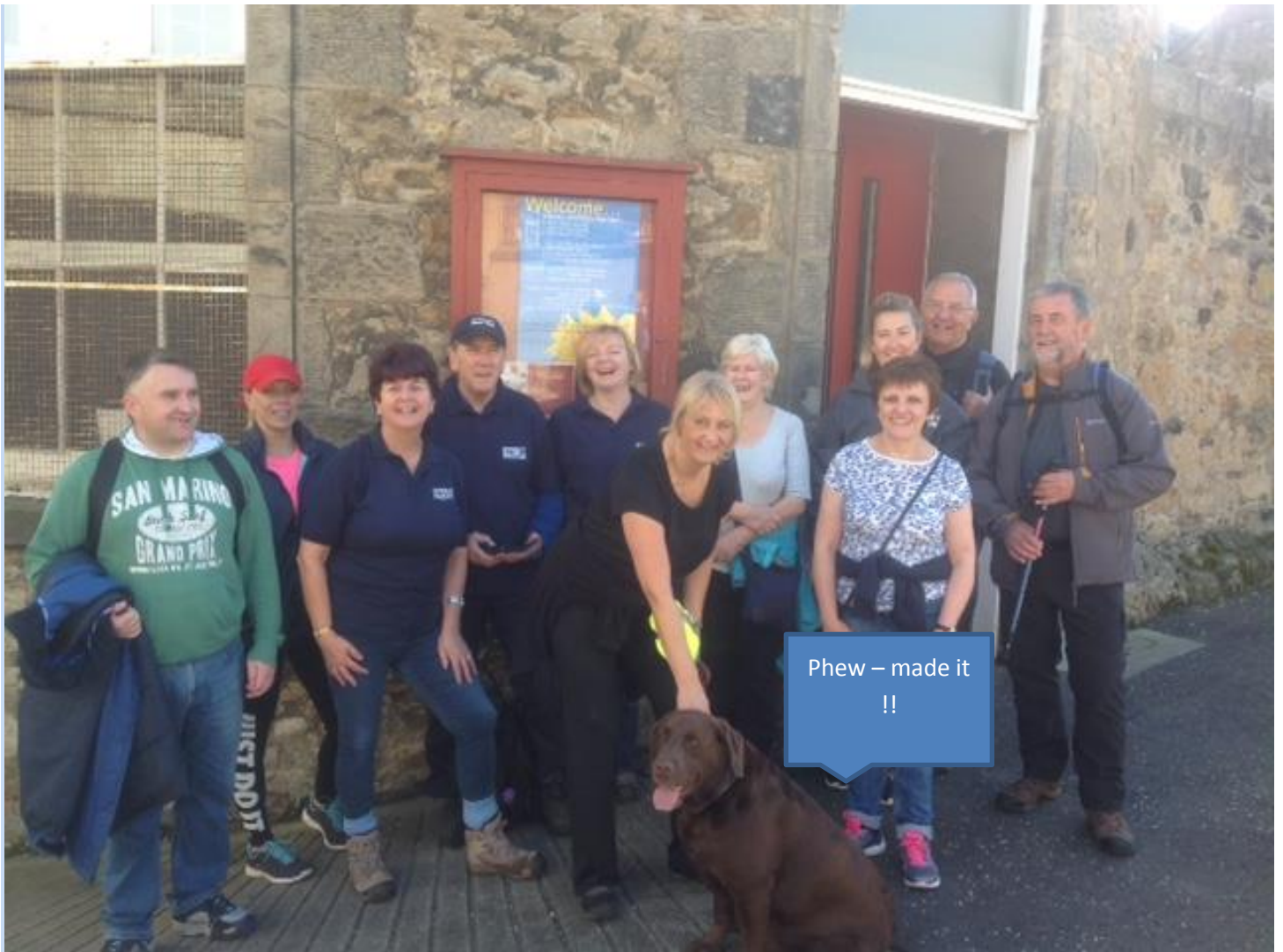
Safe arrival - Kirkcaldy Salvation Army Base – ten miles later ... Some departed here and some arrived .. ready for another ten miles to Cowdenbeath .