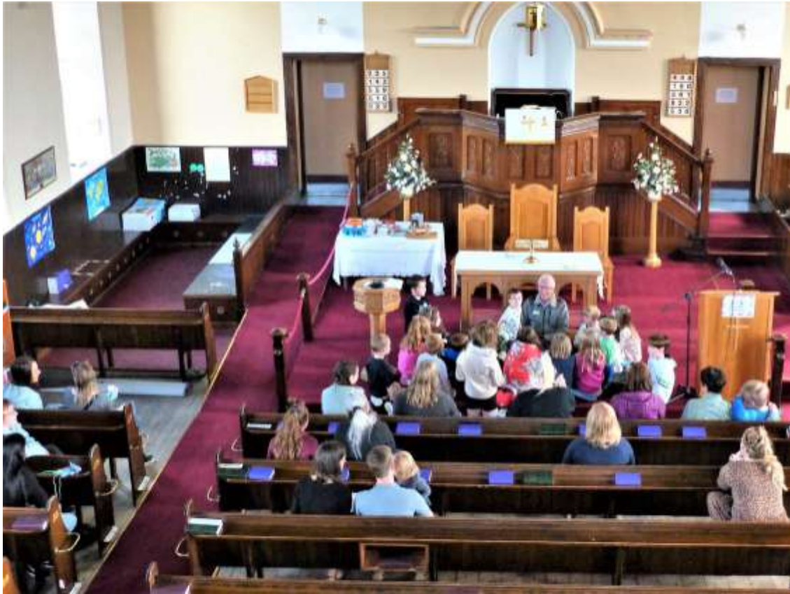
Everyone's listening to the story at Townhill & Kingsseat Messy Church

A number of Messy Churches have started or restarted in recent months, with families enjoying hearing the Good News being shared through arts & crafts, drama, games, songs and storytelling!