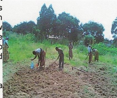
The Play4all volunteers clearing for a football pitch

Not long after my arrival, 6 years ago now, I heard of an incident where a young girl had been pushed into the road by her friends who were larking about, and had been unavoidably knocked down by a mission partner and his family. Instead of stopping to see how bad her injuries were, they simply sped on to the nearest police station, and handed themselves in, as they had been advised to do in their handbook. I thought this seemed a bit tough but was told that on no account should you stop if you caused an accident.