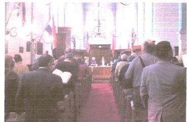
Worshipping together... Presbytery Communion service, Amsterdam