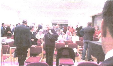
Getting down to business... The Moderator's view in Bochum, Germany.

Our congregations are drawn from six continents, and from the widest range of Christian backgrounds. In Amsterdam and Rotterdam, regular worshippers come from over 40 countries... in Bermuda, a recent stewardship campaign brought together people from both extremes of the financial spectrum... in Malta, a recent survey confirmed that six continents are represented in worship... And our mission work stretches into Africa, Asia and the Americas.