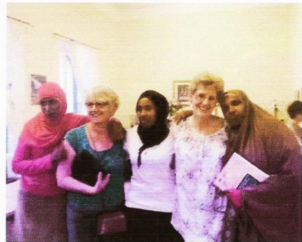
OUT OF AFRICA... INTO MALTA