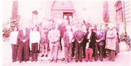
Heritage... Ministers and elders gather at the Calvin Auditoire in Geneva for a recent meeting. This congregation meets to worship where Calvin & Knox preached...