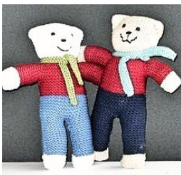
Trauma Teddies - pattern available